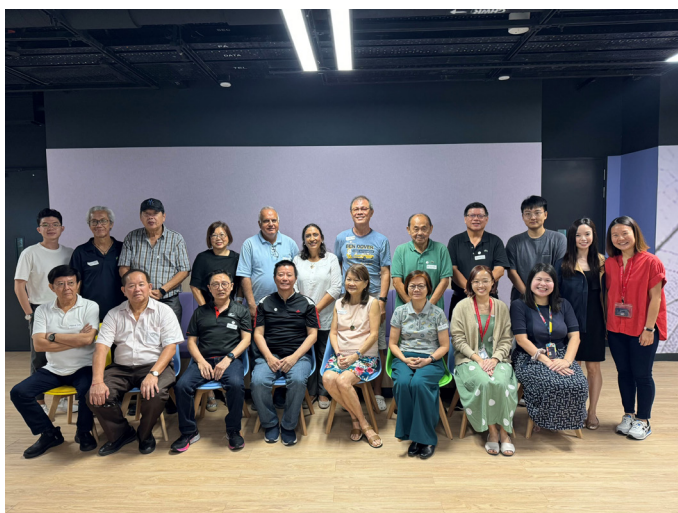
The SLP Members who joined us in the March meet-up session

We are grateful for the opportunity to have these meaningful conversations with our SLP members and thank you for taking the time to come down and share your views with us!