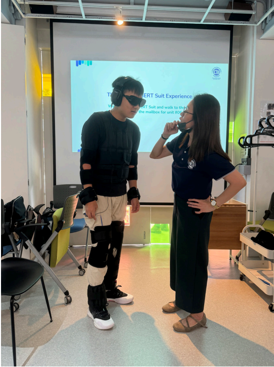
Our youngest ROSA member trying on the full GERT suit!

This enlightening experience broadened our perspective on ageing, which enriched our work, enabling us to better contextualise and tailor our efforts to the needs of older adults.